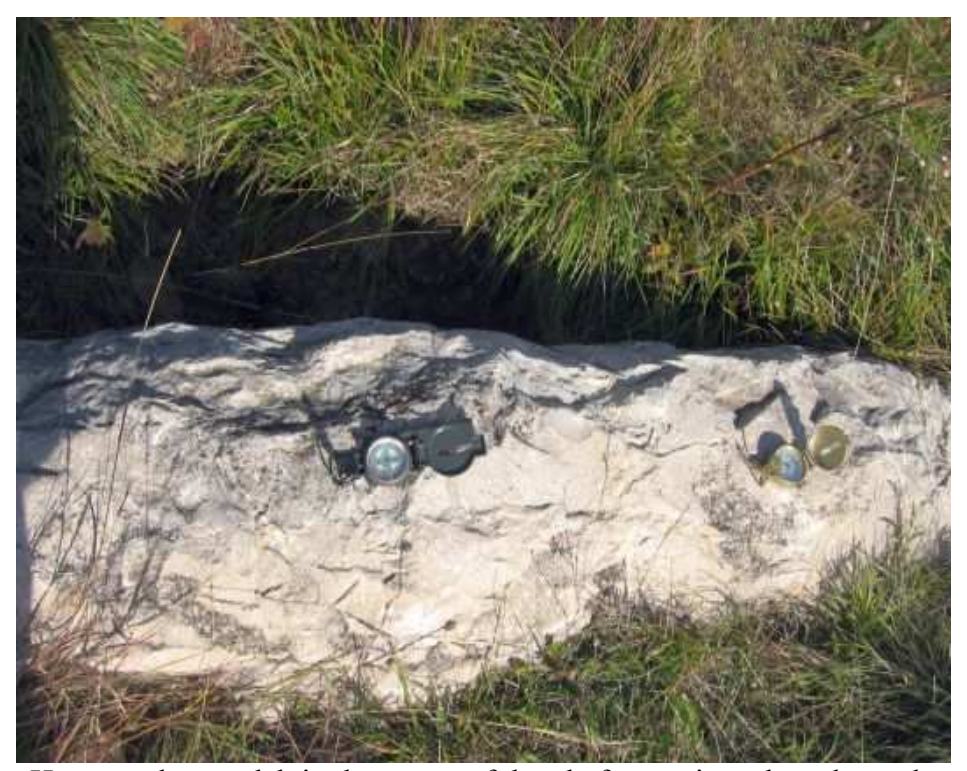
Huge sandstone slab in the centre of the platform oriented north-south.