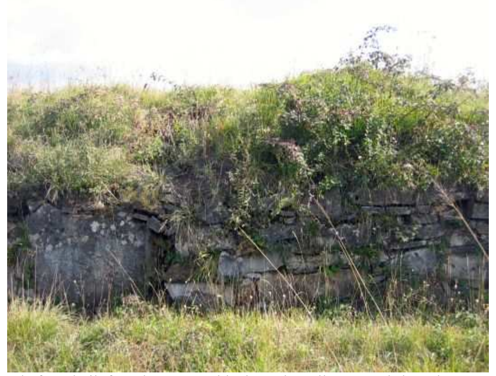
Platform built from huge stone blocks and smaller cut and shaped stones