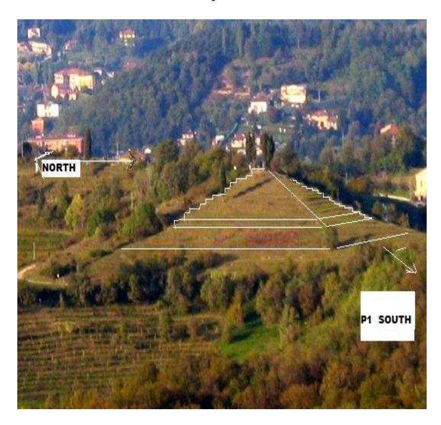
Hill No1 (P1) sketch (by G.Lukacs) shows the perfectly stepped terraces from possible base to flattened top and the north-south/east-west pointing sides. Terraces are not used for farming, while the lower regions are used for wine cultivation.

It appears to be the lowest hill, but not the smallest possible pyramid. As until October 2007 no scientific investigation has started, we cannot be sure where the pyramidal structure actually starts. Whether it starts from the bottom, or the artificial structure was put on top of the natural hill we do not know. We found terraces from top to bottom and a path to the top lined with cypress trees. The top is flat with former 12 trees standing, some now partially cut. There is an altar stone on a (recently?) built brick base in the centre of the platform.