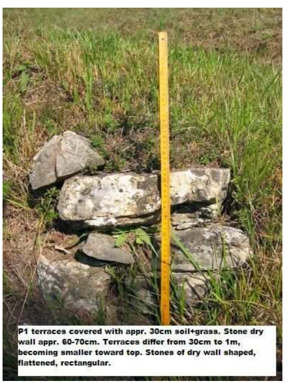
P1 terraces covered with soil and grass, built from dry walls, approx. height 60-70 cm. Rectangular stone slabs shaped to form dry wall. Foto G.Lukacs 2007