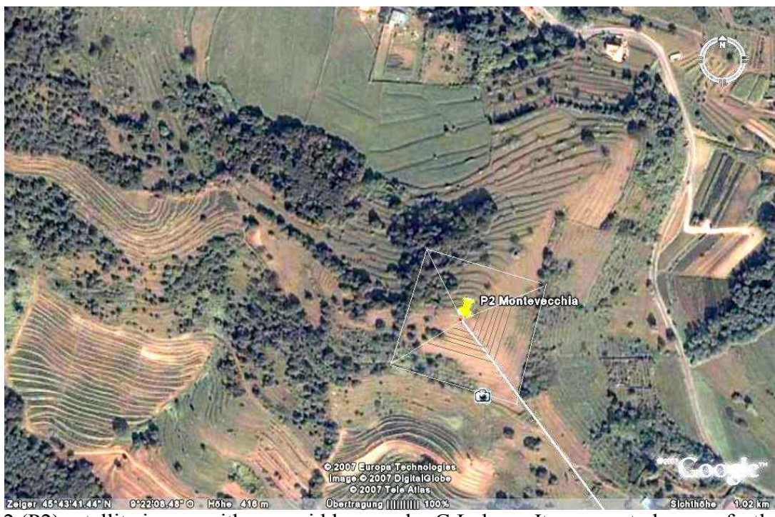
Hill No2 (P2) satellite image with pyramid layover by G.Lukacs. It appears to be a perfectly shaped structure with square base and stepped terraces, slightly offset from north-south direction.

Hill Nr. 2 (P2) is the first pyramid shape that comes into sight when approaching the area from Brivio. It has the same alignment with the cardinal points as P1 (slight offset of approx.7-12° NE). It has a large elliptical plateau (approx. 9x18 m), is fenced in as private property. The platform appears to be man built from huge stone blocks and smaller cut/shaped stones, approx. 2 m elevation. In the centre of the plareau we found a 140 cm long menhir lying in the grass pointing to N-S direction.