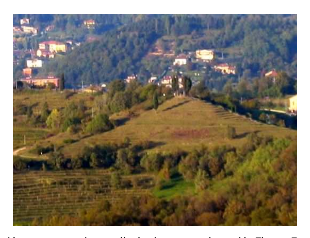
Hill Nr. 1 with step terraces and a stone lined staircase on south east side. Flat top.